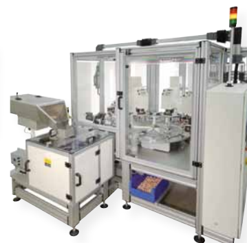
2 colour automation