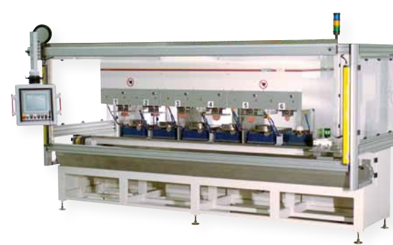
Linear automation with highspeed servo axis