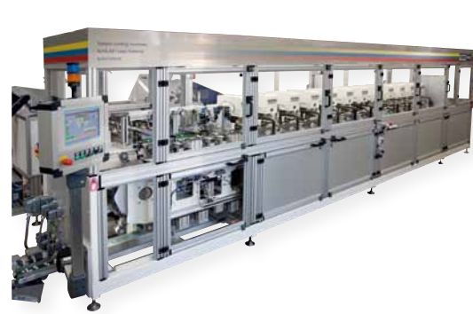
10 colour linear automation

We are your reliable partner for all industrial marking and decorating requirements