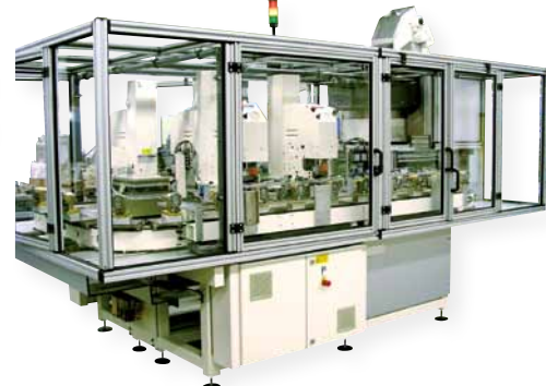
4 colour automation with feeding